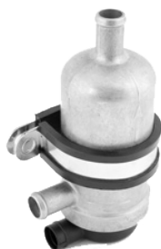
PH with original bracket